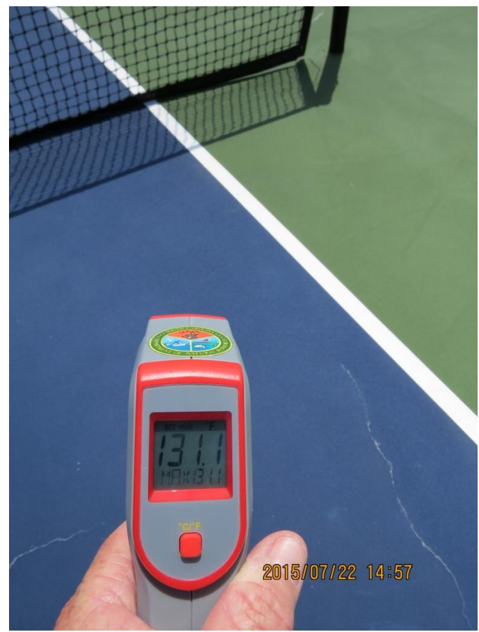
Image 8: Trenholm Park tennis courts.."medium blue" hard surface..131.1°