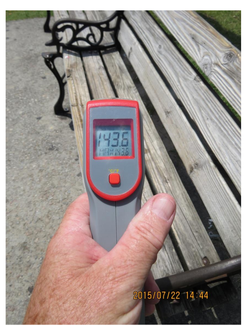
Image 7: Forest Drive Columbia transit bus stop bench..wooden planks over cement base..143.6°