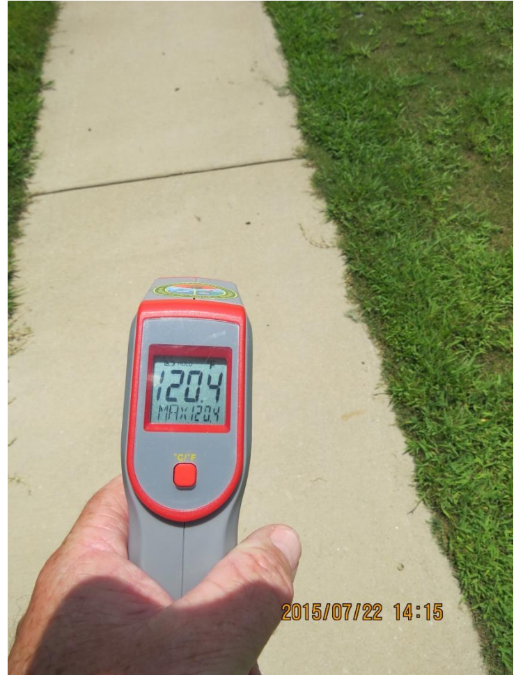
Image 3: AC Flora High School walkway between practice football/soccer fields..concrete..120.4°