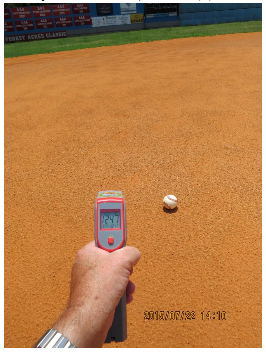
Image 1: AC Flora High School baseball field.. clay/sand.."shortstop" position..124.7°

Published studies indicate human contact with a surface temperature of 111° results in pain. Contact temperatures at or above 118°, present a burn danger. Contact with surface temperatures of 140° for three seconds may result in a 2<sup>nd</sup> degree burn.