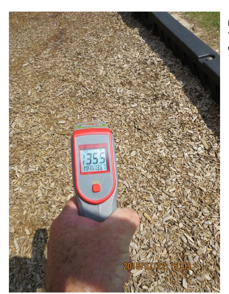
Image 10: Trenholm Park children's playground..wood chips ground covering..135.5°