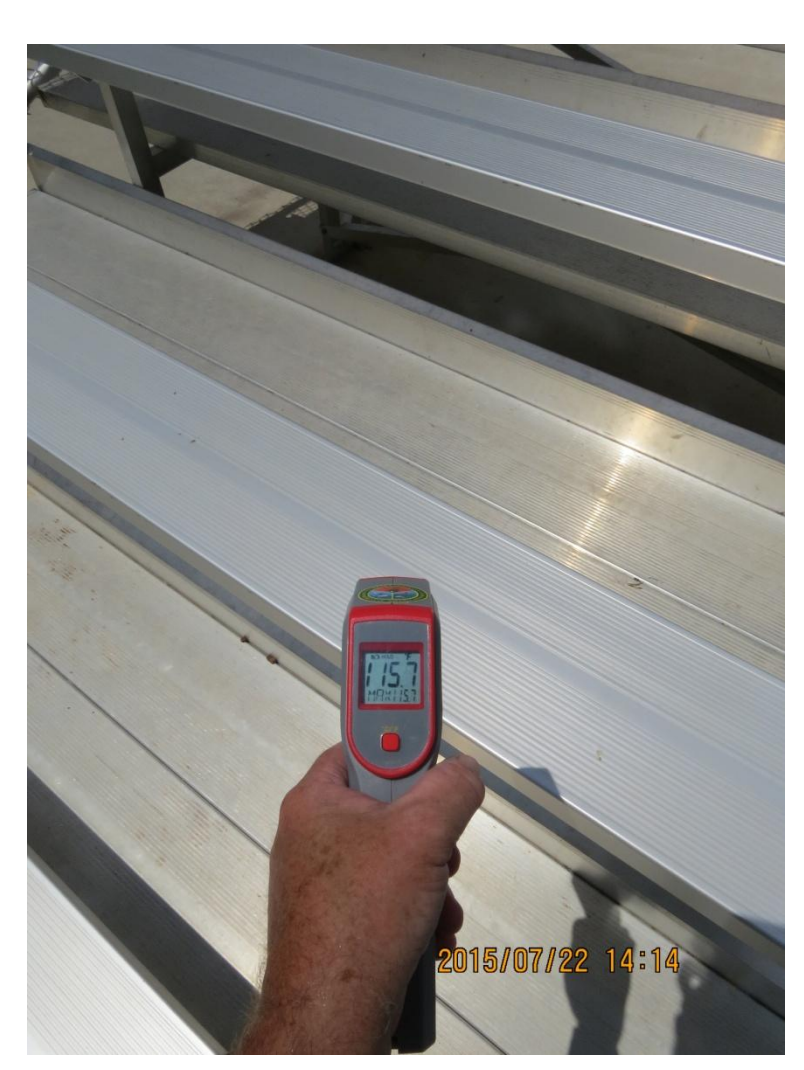
Image 2: AC Flora High School baseball field..aluminum seating..115.7°